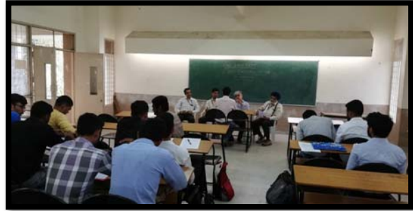
Mock Interview for final year students