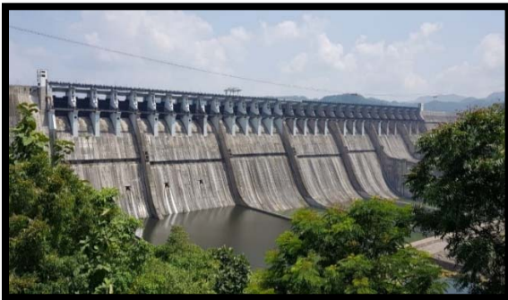
Visit to Narmada Dam