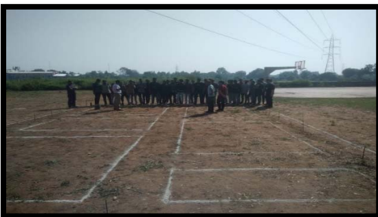
Building Layout Surveying (second year)