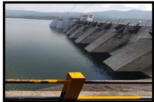
Power Plant visit