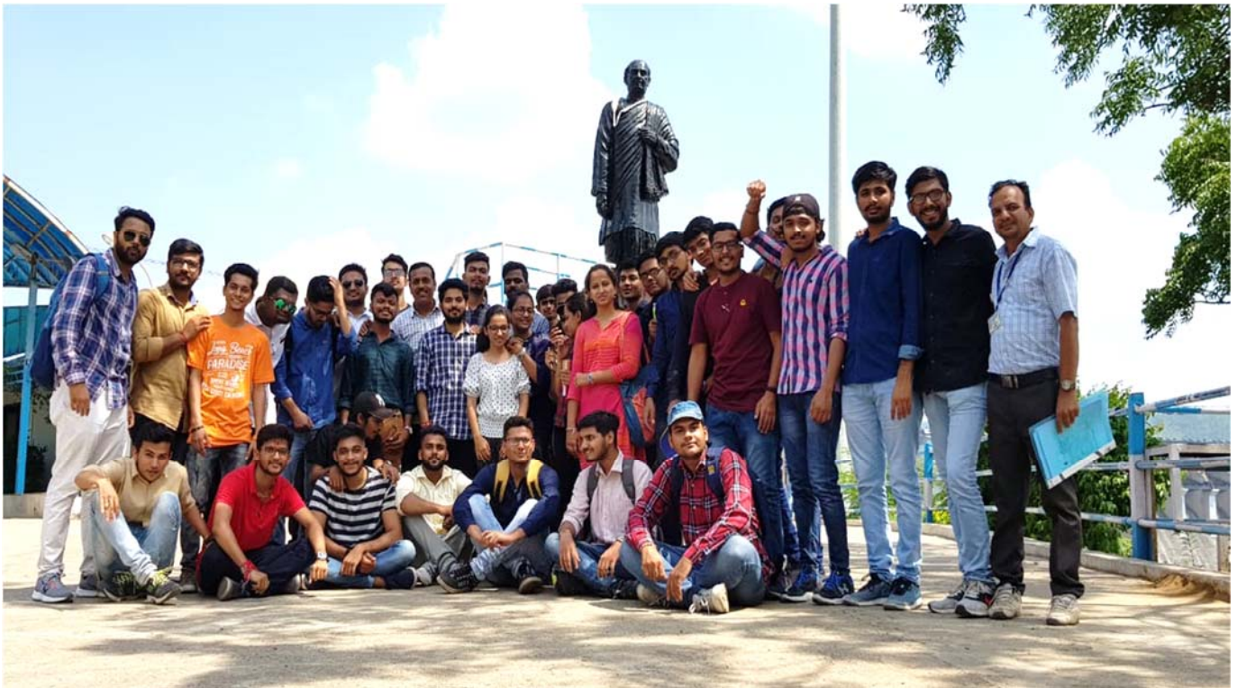
4 th year Batch