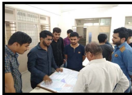
Poster Presentation – Soil Mechanics