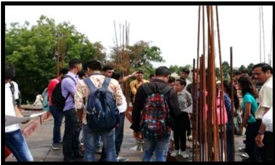
Visit to Anupam Mission School Building