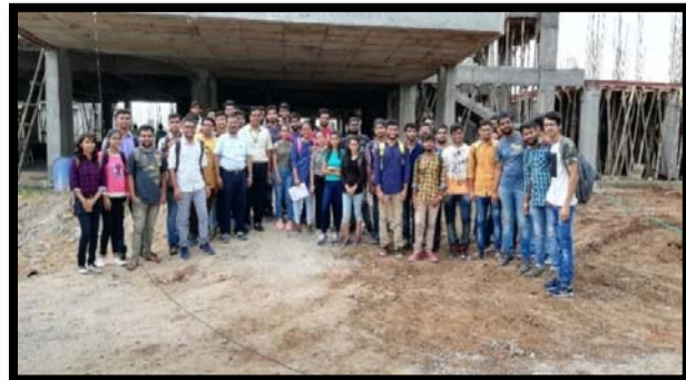
Construction site visit