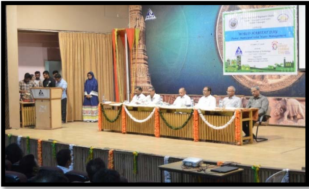
World Habitat Day workshop