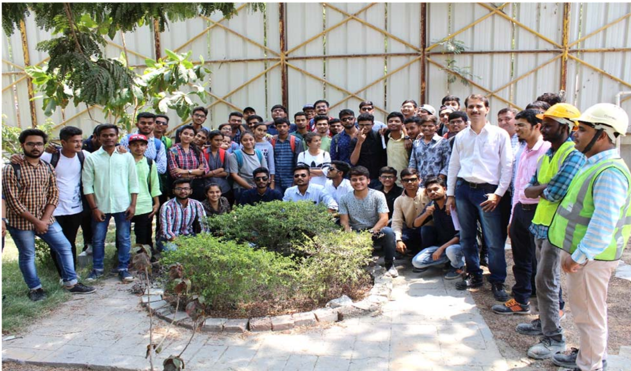
3 rd year Batch