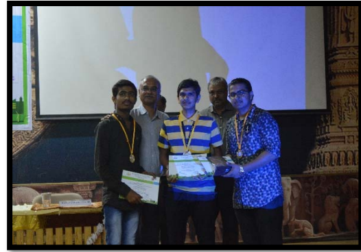
SY students won third prize in poster competition