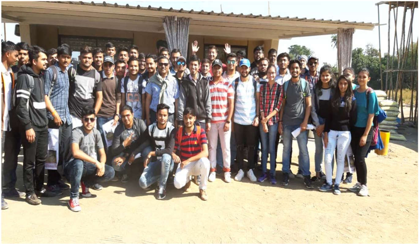
2 nd year Batch