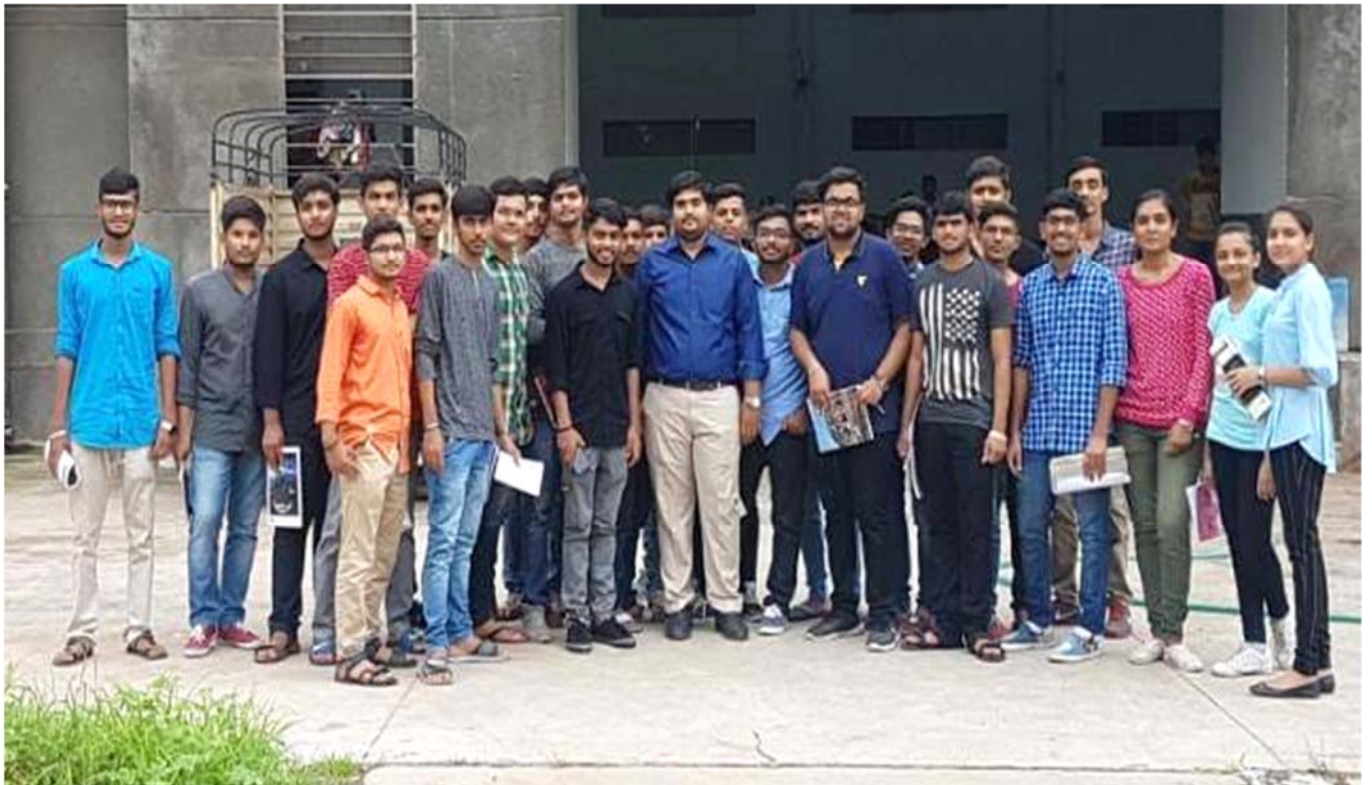
1 st Year Batch